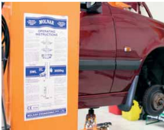
Low risk example. Operating instructions prominently displayed.