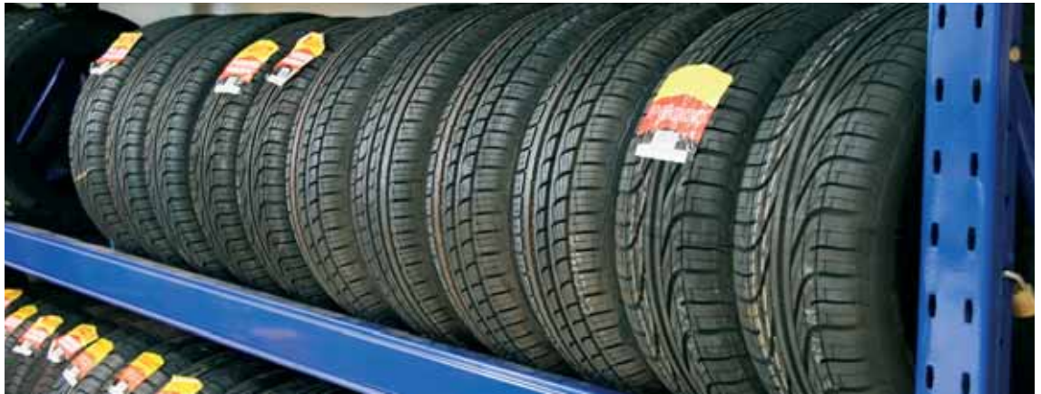
Low risk example. Storage system kept below shoulder height.

Hazards include: High force and awkward postures from lifting, lowering, and handling tyre/wheel assemblies. Falls from heights (eg ladders and mezzanine floors). Falls on level surfaces with tripping hazards.