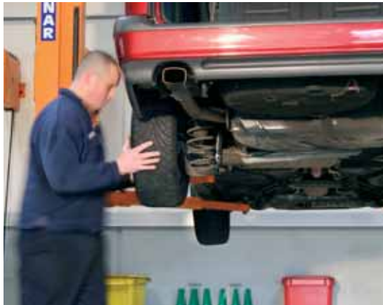
Low risk example. Vehicle on hoist with wheel at waist height.