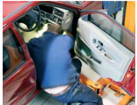
High risk examples. Awkward postures held for too long without a break.

Hazards include: awkward or sustained postures which result in injury to employees.