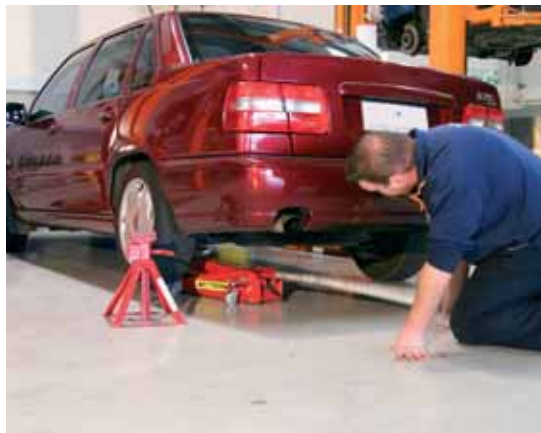
Low risk example. Trolley jack and axle stands used at all times.

Hazards include: failure of lifting equipment causing crushing injuries and/or fatalities.