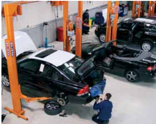
Low risk example. A neat and tidy workshop area.

Hazards include: moving vehicles that may cause injury to employees and members of public.