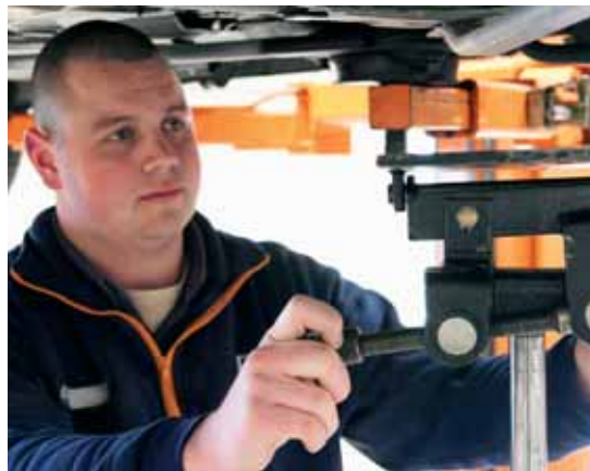
Low risk examples. Manual handling aids used to carry and lift heavy components.

Hazards include: High force and awkward postures while lifting, lowering, and handling heavy components, eg wheel assemblies, engines, gearboxes, etc.