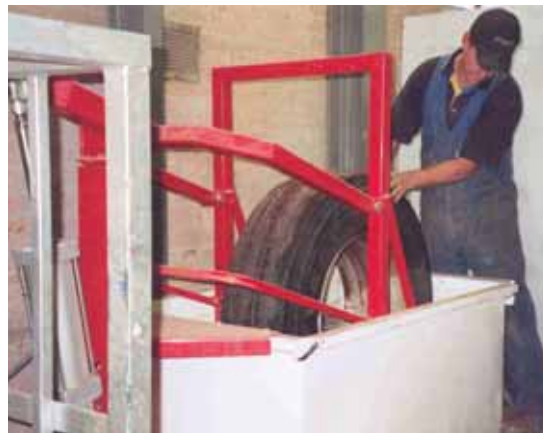
Low risk example. Bead breaker and mechanical aid used with leak detection bath.