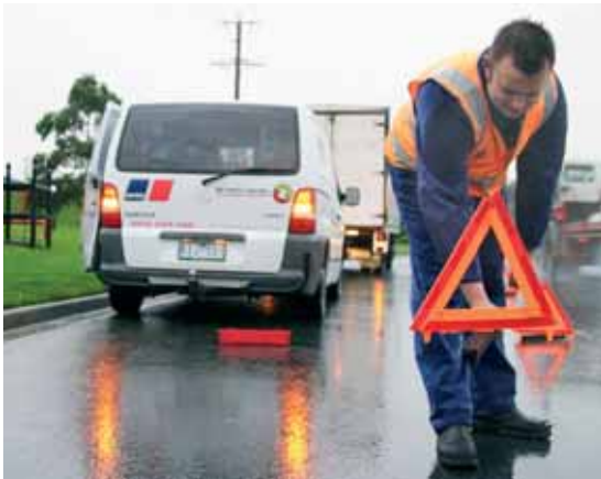
Low risk example. Prominent warning signs for approaching drivers.