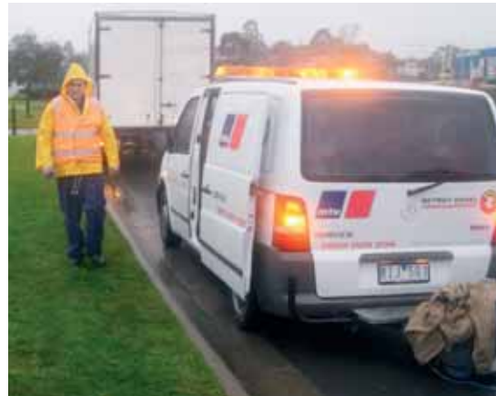
Low risk example. High visibility vests and warning lights.

Hazards include: high speed traffic, poor visibility and weather conditions, loose, soft or sloping ground conditions. Employees may be struck by a passing vehicle or crushed by the vehicle moving off jacks. These control measures are applicable to all vehicles.